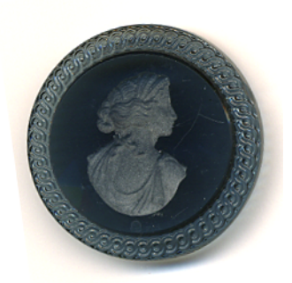
36mm round and 21mm round Demeter