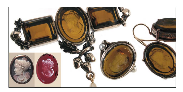
Extasia's Josephine Suite for Reunion, French Government

Using a 19<sup>th</sup> century agate cameo as a model, Extasia created a stone in the image of Empress Josephine and a suite of styles sold at many of the RMN owned gift stores throughout France.