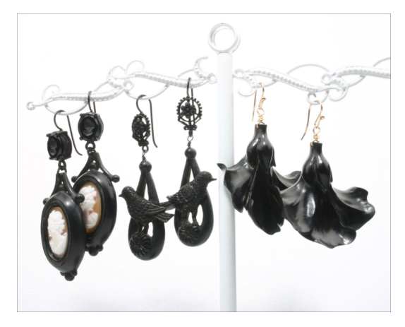
Hand carved fossilized jet earrings

Today, it finds its way into Extasia's rare materials collection in the form of birds, flowers, bees, and other images inspired by nature.