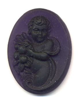
40\30mm oval *

Dionysus – Is the Greek god of wine, inspirer of ritual madness and ecstasy, and the patron deity of agriculture and the theater. Dionysus is also known as Bacchus in Roman mythology.