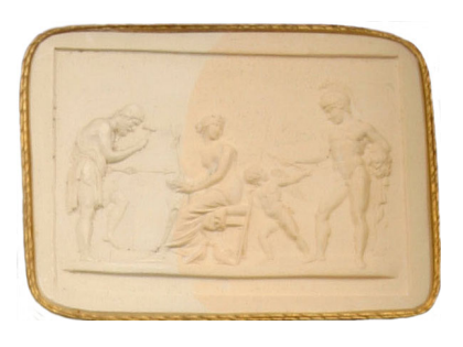
Thorvaldsen's original plaster 2\frac{1}{4} " x 1 7/8"

Achilles – This image is believed to be Achilles at the Forge of Vulcan. In Greek mythology, Achilles was a Greek hero of the Trojan War.