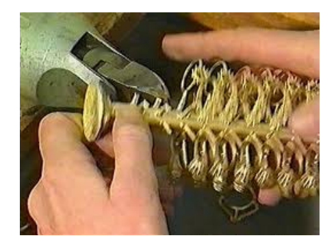
Modern lost wax casting method – sprew tree

Extasia's settings are cast using the same technique as fine jewelry - lost wax casting. It is one of the oldest forms of fabrication predating the Pyramids in Egypt, and has been updated over time using modern technologies.