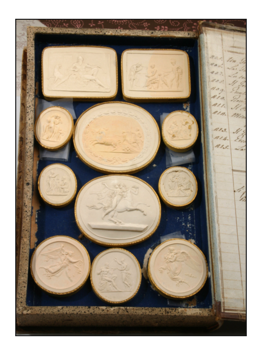
Original plaster molds by Bertel Thorvaldsen, ca 1800

Following is a brief description of the images created by Bertel Thorvaldsen and information on the artist.