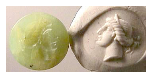
The image on the left is intaglio. The image on the right is cameo

At Extasia we use cameos and intaglios in a variety of materials; hand – carved shell from the coast of Italy, hand-pressed glass, hand-cast glass and hand-carved jet and fossilized mammoth ivory.