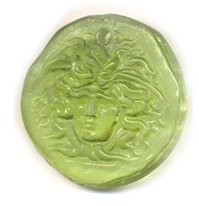
45mm irregular round Medusa in Pate de Verre glass

who is mortal. Her gaze turned whomever she looked upon to stone. In a particular myth, Medusa is originally a beautiful maiden who desecrated Athena's temple by lying there with Poseidon. Outraged, Athena turned Medusa's hair into living snakes.