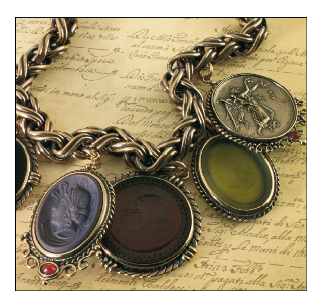
Inspired by the Classics, Created for the Moment

People visit museums to experience the inspiration of art, history, learning and beauty and to be reassured by the presence of daily objects from the past. In that spirit, Extasia marries historical images with contemporary fashion to create a uniquely sophisticated museum store collection.