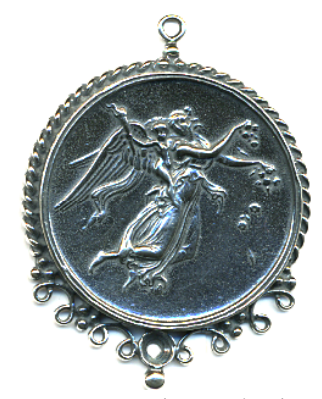
Aurora Extasia reproduction 1 ½" in diameter