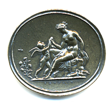
Venus & Cupid Extasia reproduction 1 ¾" x 1 ½"

Venus & Cupid --Venus the Roman goddess of love and fertility is depicted with Cupid, the son of Venus and Mars, the god of war.