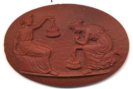
55\35mm oval reproduced from mid 19<sup>th</sup> century Italian hand-carved lava stone pin

merchants kept stalls or shops to sell their goods amid colonnades. This image depicts a market scene from ancient Greece.