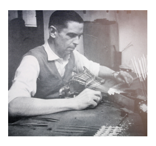
Lampwork glass making

Glass stone making is an exacting craft done by a small group of artisans in Western Europe. Sadly, this craft is dying out. Extasia has made significant contribution to the revival of the glass stone industry by commissioning new molds and colors, which show the art at its best and most expressive. Ninety percent of the images we use are our original, proprietary designs.