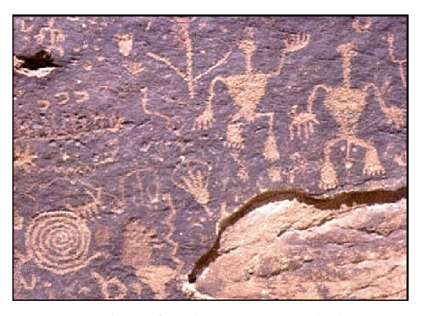
Early art form known as petroglyphs

The beginnings of intaglios can to be found in cave etchings dating back over 15,000 years ago. Carvings of animals, gods, and humans meant to inspire, protect, and inform us appeared, and over time, evolved from cave walls to cylinder stones.