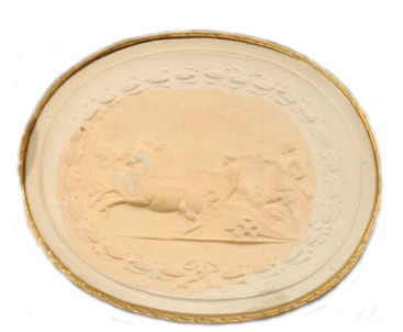
Thorvaldsen original 2 ½" x 2 ¾"

Alexander the Great – A detail from the Triumph of Alexander the Great depicting the entrance of Alexander into Rome.