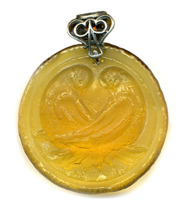
42mm round doves cast in glass

craftsman, Robert Kahl, creates a glass paste, spreads it into a plaster mold then kiln fires it into a liquid state. After a slow cool down the hardened image is removed. The mold is broken in the process and can only be used once or twice at the most.