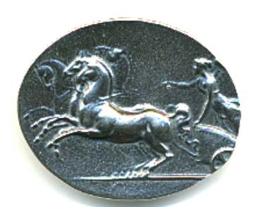
Alexander the Great Extasia reproduction 1 ¼" x 1"